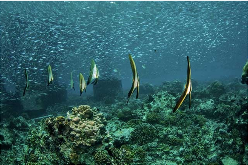
Juvenile longfin batfish.

mangroves. You find the adults in deeper water on reefs and wrecks down to 20 or 30 m.