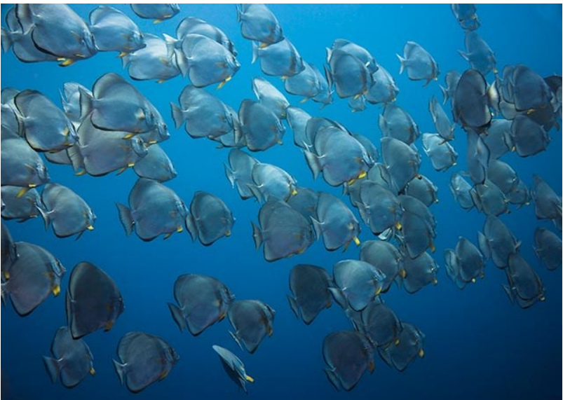
Shoal of circular batfish.

All Batfish have thin deep bodies. Other features they have in common are their greyish colouring and the two black or grey stripes going vertically down their bodies, one through the eye and the other at the back of the head. They grow to between 45 and 60 cm long.