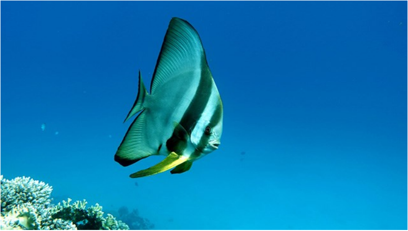
Longfin batfish.

throughout the Indo-Pacific, although not all species are represented in all areas. In the Red Sea, for example, you will see just three species: longfin batfish ( Platax teira ), circular batfish ( P. orbicularis ) and golden batfish ( P. boersii ).