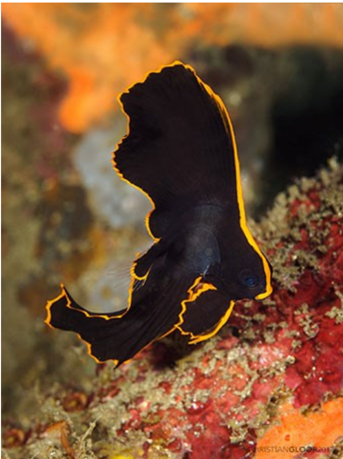
Juvenile dusky batfish mimics a turbellarian flatworm both in coloration and body shape.

Juveniles of the dusky batfish ( P. pinnatus ), look and behave like toxic flatworms. They too lay on their sides but these undulate just like the flatworm would.