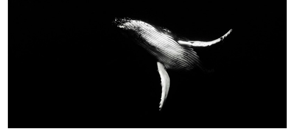
Humpback Whale Song