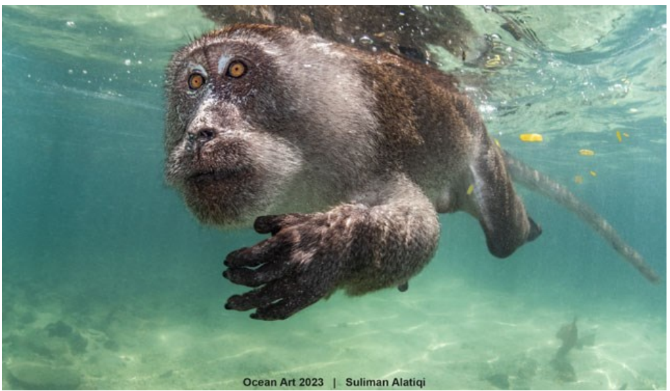
Ocean Art 2023 | Suliman Alatiqi

A rare and fascinating portrait of a Crab-Eating Macaque resolutely swimming through the ocean, captured by Suliman Alatiqi, tops this year's Ocean Art underwater photography contest. The photo is a result of weeks of planning and documentation, and it represents the zeal and commitment needed to capture the world's best underwater image.