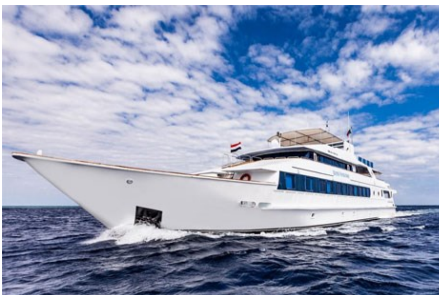
Escape the crowds with this liveaboard to the little dived Elba reef plus Elphinstone and St Johns. Or choose the Northern wrecks trip.

Swimming monkey shot wins world's largest underwater photo contest