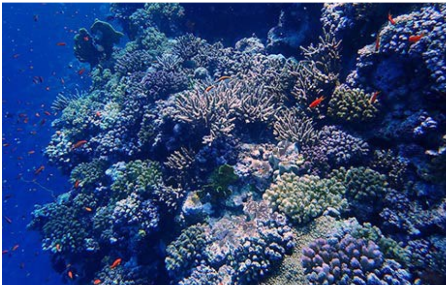
Beautiful corals at St Johns, Red Sea