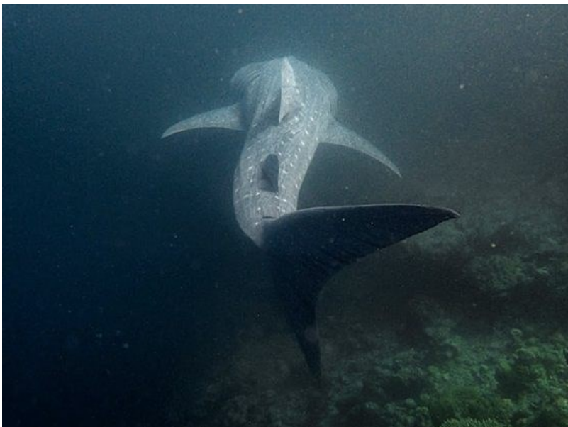
Photo taken as part of the Maldives Whale Shark Research Program

The Maldives Whale Shark Research Program is a research-based conservation charity dedicated to studying the whale shark and fostering community-focused conservation initiatives in the Maldives and the greater Indian Ocean. They offer a citizen science volunteer program which I signed up for.