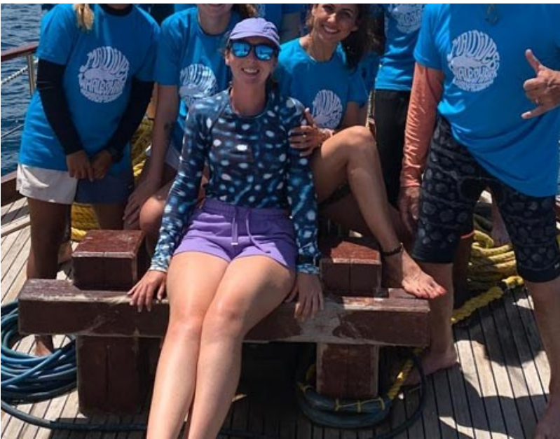
Volunteers on the Maldives Whale Shark Research Program

To become a volunteer, one does not need to be a scientist or marine biologist! MWSRP welcomes people of all ages, talents, and nationalities. If you love whale sharks and you are not afraid of hard work get in touch!