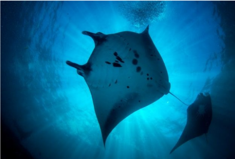
Manta Ray.

Volunteers not only record whale shark sightings, but also include megafauna such as sea turtles, mantas, other rays and dolphins.