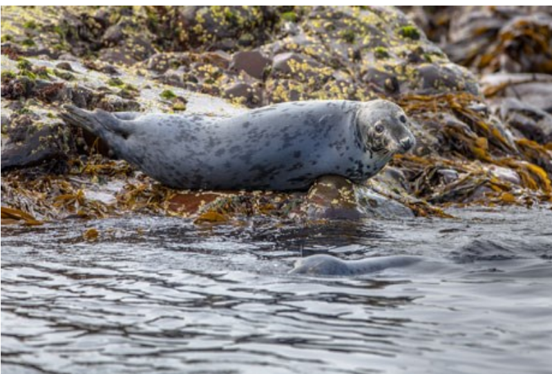
Grey Seal in the Farne Islands.

The grey seal ( Halichoerus grypus ) is the second largest seal in the world, second only to the elephant seal. It lives in the northern Atlantic, with half of the world's population living around the British Isles.