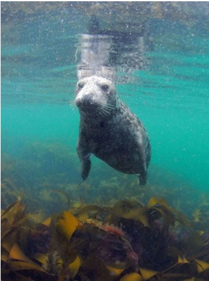
Grey Seal watching a diver in the Isle of Man. Tim Nicholson

The seals return to the same shore to haul out. They don't stay close to that area though, they can travel over 100 km between their haul-out and foraging sites. These feeding trips last as much as 30 days, and they can cover the 100 km in just one day.