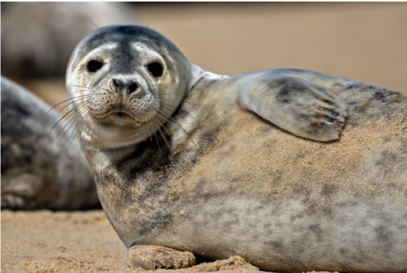
Grey Seal hauled out. Alan De Witt

The seals return to the same shore to haul out. They don't stay close to that area though, they can travel over 100 km between their haul-out and foraging sites. These feeding trips last as much as 30 days, and they can cover the 100 km in just one day.