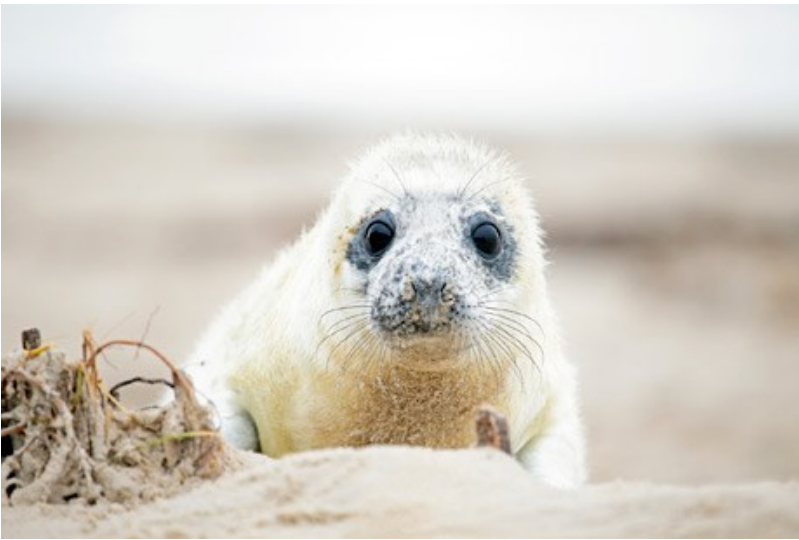
Baby Grey Sea.

The grey seal is so called because of its coat, which is various shades of grey. The pups though are born white. Female pregnancies last 11 months, and they then look after the pup until around three weeks later when it is weaned.