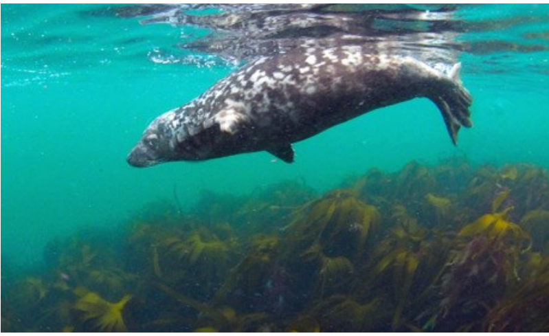
Grey Seal keeping an eye on the photographer, Tim Nicholson.

Female grey seals have been recorded living to 42 years in the wild. Males are thought to live less long, to a maximum of 31 years.